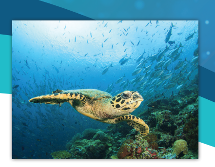
Salinty Density Stratification